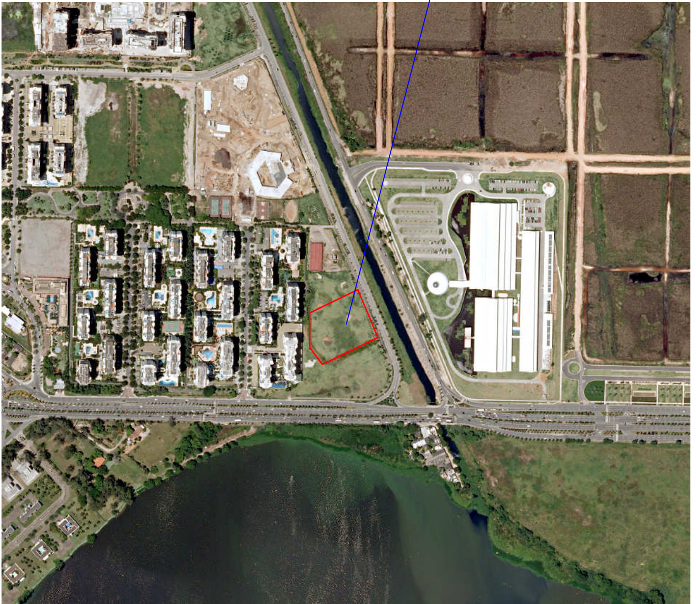
Dimensões e Área de acordo com o PAL 44.069